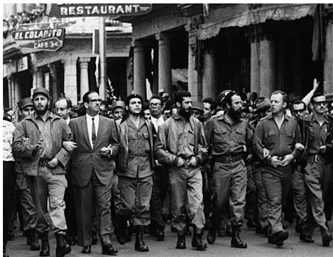
March 5, 1960, Havana, Cuba. A memorial service march for victims of the La Coubre explosion. From left to right: Fidel Castro, Osvaldo Dorticós Torrado, Che Guevara, Augusto Martínez Sánchez, Antonio Núñez Jiménez, William Alexander Morgan and Eloy Gutiérrez Menoyo.

U.S.-Cuba relations deteriorated rapidly: the U.S. economic embargo, imposed as a