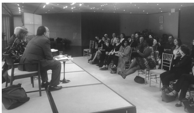
The “lively” discussion drew in a rapt audience.

The discussion was described by one of the more than a score of participants as “lively and wide-ranging” on such topics as the usefulness of and gaps in foundation archives, donor intent and the usefulness of foundation history in formulating new programs.